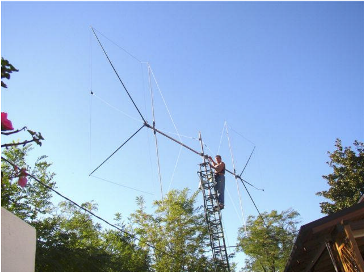
Fig.1: the Waller Flag built by IV3PRK

Everything went in order again with the lobe and the FB as before! A little more complicated in the construction, but quite easy to do.