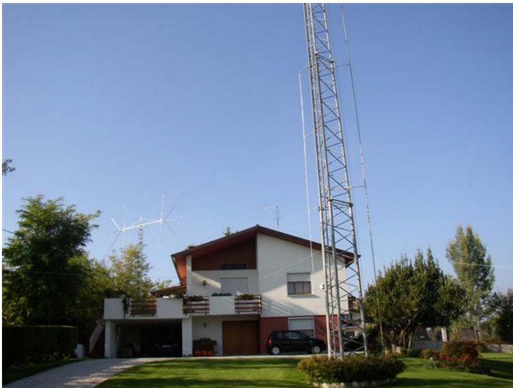
Last picture of the Waller Flag before dismantling and the Tx antenna showing the detuning rod on the left and the gamma rod on the right.